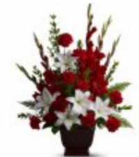
ABB TRES - February 27, 2019 at 01:16 PM

“ ABB TRES purchased the Tender Tribute for the family of Timothy Shawley.