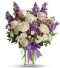
ABB CUBE Americas - February 27, 2019 at 01:26 PM